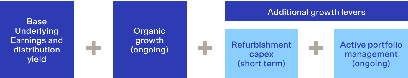
FIGURE 1: YIELDS PLUS INDUSTRY GROWTH

The Fund seeks to deliver regular distributions and the potential for earnings and capital growth underpinned by a Portfolio of 27 hotels (as at the date of this PDS). The Fund is targeting organic growth within the business, plus potential capital and earnings growth from active portfolio management, including investment in the refurbishment or redevelopment of Fund assets.